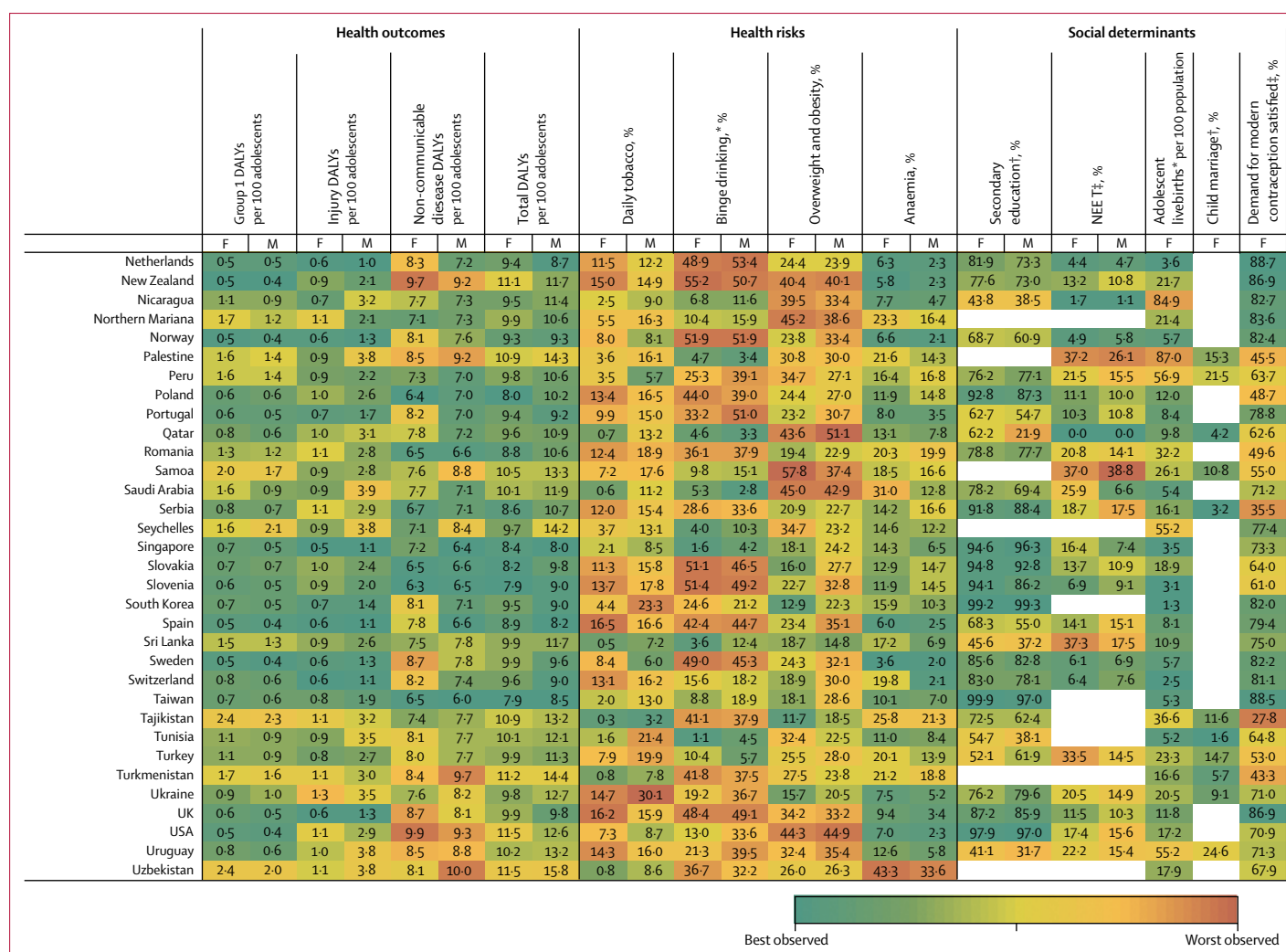
Figure 3: Multi-burden (A), injury-excess (B), and non-communicable disease-predominant (C) country-specific estimates of the 12 indicators for adolescent health and wellbeing, by sex Data are most recent country-level estimates for each indicator (2010 for education [except New Zealand, 2005], median of 2013 for child marriage, median of 2015 for NEET, and 2016 for all others), blank spaces indicate missing data. Health outcomes are DALYs per 100 adolescents, and health risks and social determinants are prevalences, unless otherwise stated. Data are for adolescents aged 10–24 years, unless otherwise stated. For each indicator and sex, countries are shaded on a scale from green (best value observed) to red (worst value observed); for most indicators green signifies the lowest value with the exception of secondary education and demand for contraception satisfied for which it signifies the highest value. DALYs=disability-adjusted life-years. F=females. M=males. NEET=not in education, employment, or training. *For individuals aged 15–19 years. †For individual aged 20–24 years. ‡For individuals aged 15–24 years.

1990 to 2016: –2.8% for females and –2.9% for males (appendix). In 2016, Lesotho and Central African Republic, both multi-burden countries, had the highest group 1 DALY prevalence for females and males (>15000 DALYs per 100000 population), whereas Australia and France had prevalences of less than 500 DALYs per 100000 population (figure 3). DALY prevalence due to group 1 conditions decreased in almost all countries, except in four multi-burden countries (Lesotho, Swaziland, South Africa, Zimbabwe) and two injury-excess countries (Virgin Islands and Mozambique; appendix). Between 1990 and 2016, females in Lesotho had the greatest annual increase in group 1 DALYs (6.8%) of any sex in any country. Uncertainty estimates for country-level estimates of group 1 DALYs are shown in the appendix.